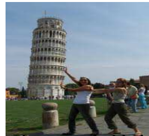
They ----- the tower in his hands for to take a pic