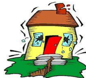
The tremor ----- the earth last year.