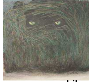
The panther was ----- while watching us.