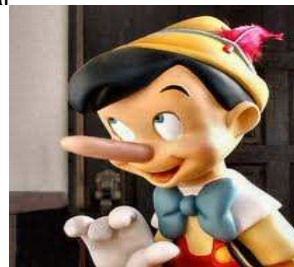
Pinocchio ----- , I see it in his nose.