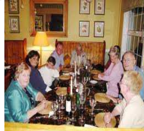
We ----- our parents last month.