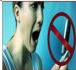
They ----- her cell phone service.