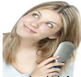
She ----- her hair for hours.