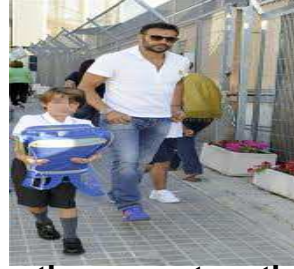
Yesterday, they ----- together to class.